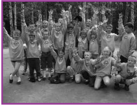
Above: Children at Detsky Dom 31